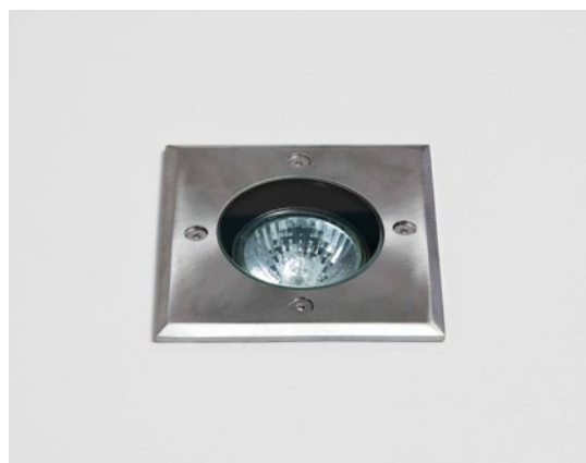
CODE: 1312003 FINISH: BRUSHED STAINLESS STEEL

TO MAINTAIN THIS PRODUCT TO ITS BEST CONDITION, PLEASE VIEW OUR CARE AND CLEANING GUIDE ON THE SUPPORT SECTION OF THE ASTRO WEBSITE.